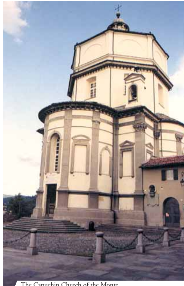
The Capuchin Church of the Monte

During the invasion by Count Harcourt's army, the soldiers entered the Church of St. Maria del Monte and killed many civilians. The lives, however, of the Capuchin friars were spared. A French soldier succeeded in opening the tabernacle which contained a ciborium with several consecrated Hosts. Flames of fire miraculously blazed out to envelop him - burning his face and his clothing. The door of the tabernacle which is adorned with agate and lapislazzuli or blue stones still shows the imprint of the soldier's scorched hand.