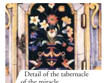
Detail of the tabernacle of the miracle