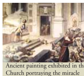
Ancient painting exhibited in the Church portraying the miracle